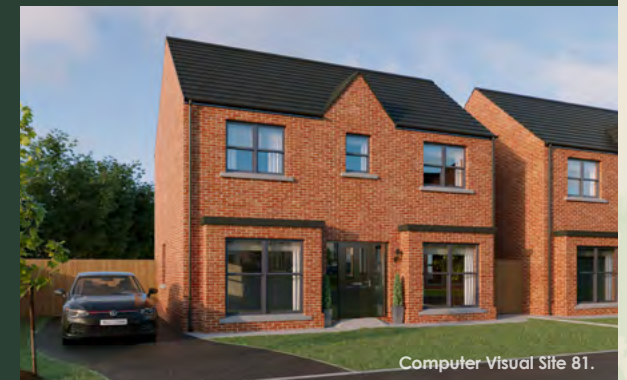
Computer Visual Site 81.

In compliance with Consumer Protection from Unfair Trading and Business Protection from Misleading Marketing Regulations, please note that any visual or pictorial representations as featured in this brochure such as 3D computer generated images are purely intended as a guide for illustrative, concept purposes only and often may be subject to change. Levels, steps, boundary treatments and landscaping may vary from those shown. Any floor plans and site layouts used are not to scale and all dimensions are approximate, taken from widest points and subject to change.