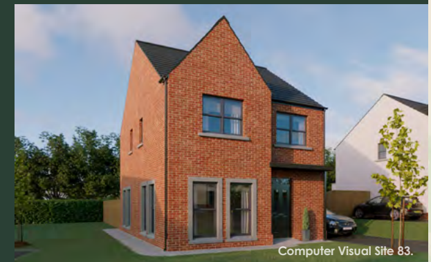
Computer Visual Site 83.

In compliance with Consumer Protection from Unfair Trading and Business Protection from Misleading Marketing Regulations, please note that any visual or pictorial representations as featured in this brochure such as 3D computer generated images are purely intended as a guide for illustrative, concept purposes only and often may be subject to change. Levels, steps, boundary treatments and landscaping may vary from those shown. Any floor plans and site layouts used are not to scale and all dimensions are approximate, taken from widest points and subject to change.