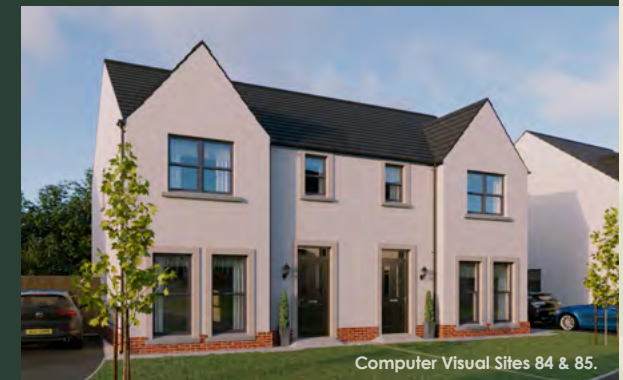
Computer Visual Sites 84 & 85.

In compliance with Consumer Protection from Unfair Trading and Business Protection from Misleading Marketing Regulations, please note that any visual or pictorial representations as featured in this brochure such as 3D computer generated images are purely intended as a guide for illustrative, concept purposes only and often may be subject to change. Levels, steps, boundary treatments and landscaping may vary from those shown. Any floor plans and site layouts used are not to scale and all dimensions are approximate, taken from widest points and subject to change.