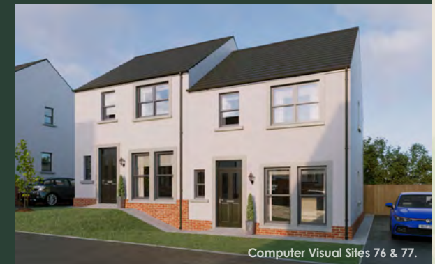
Computer Visual Sites 76 & 77.

In compliance with Consumer Protection from Unfair Trading and Business Protection from Misleading Marketing Regulations, please note that any visual or pictorial representations as featured in this brochure such as 3D computer generated images are purely intended as a guide for illustrative, concept purposes only and often may be subject to change. Levels, steps, boundary treatments and landscaping may vary from those shown. Any floor plans and site layouts used are not to scale and all dimensions are approximate, taken from widest points and subject to change.